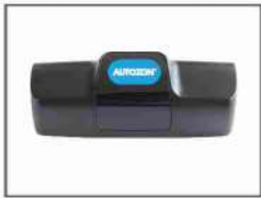
AZ MRS 68 Microwave Sensor