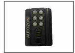
AZ SLD TX 69 Transmitter