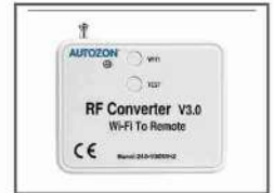
AZ WIFI 31 A Wifi Module