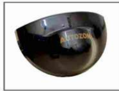
AZ OMS 68 01 Microwave Sensor