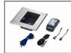
AZ FS 92 Foot Sensor