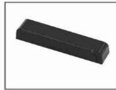
AZ SLDRIS68 02 Microwave & Infrared Sensor