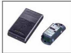
AZ SLD WLTS 74 Wireless Touchless Sensor